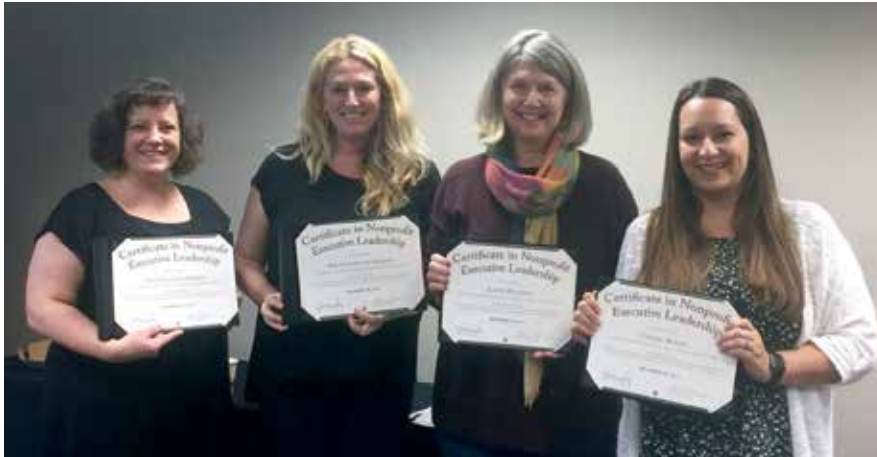
The first cohort of NCHS Nonprofit Executive Development Initiative scholarship recipients completed their certification in nonprofit executive leadership in 2017.